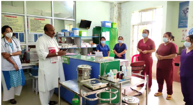
IT News Chandel, August 29:

Union minister of Social Justice & Empowerment Dr. Virendra Kumar today visited Chandel district of Manipur and inspected programmes being taken up under the Aspirational Districts