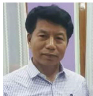
By: N. Munal Meitei

Winners don't wait for chances but take them. Sports play a very significant role in our present world. A person who engages himself in sports on a regular basis sustains a healthy and wealthy lifestyle. It not only fosters health but keeps your mind fit. Outstanding achievements knock on your door when one is healthy enough to pass all the hurdles in life.